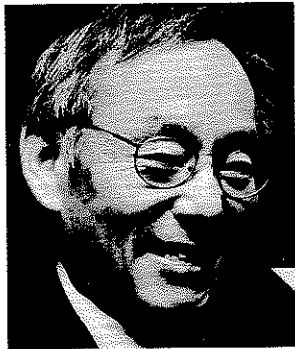
Energy Honcho STEVEN CHU